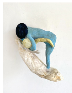
Transit ceramic & paint 2024 9" H x 8" W x 6" D