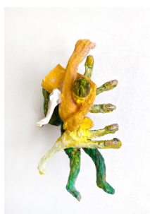
View Ceramic, paint, mixed media 2024 9" H x 7" W x 5" D