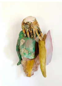
The Green Shirt ceramic & paint 2025 12" H x 10" W x 6" D