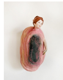
Coil ceramic & paint 2024 7" H x 5" W x 4" D