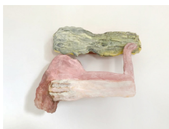
D2 ceramic & paint 2025 8" H x 11" W x 4" D