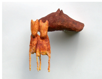
Three Horses Ceramic, paint, mixed media 2022 | 8" H x 7" W x 5" D