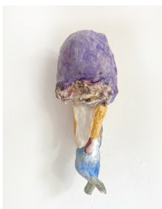
It Might Rain ceramic & paint 2025 10" H x 5" W x 4" D