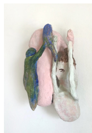
Refuge 3 ceramic & paint 2025 10" H x 8" W x 5" D