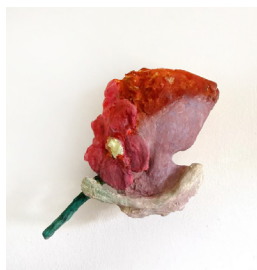
Flowerhead ceramic & paint 2024 9" H x 5" W x 4" D