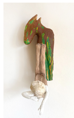
Fanny Ceramic, paint & shell 2025 | 12" H x 5" W x 7" D