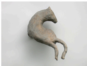
It's a Horse Bronze 2020 | 11" H x 7" W x 7" D